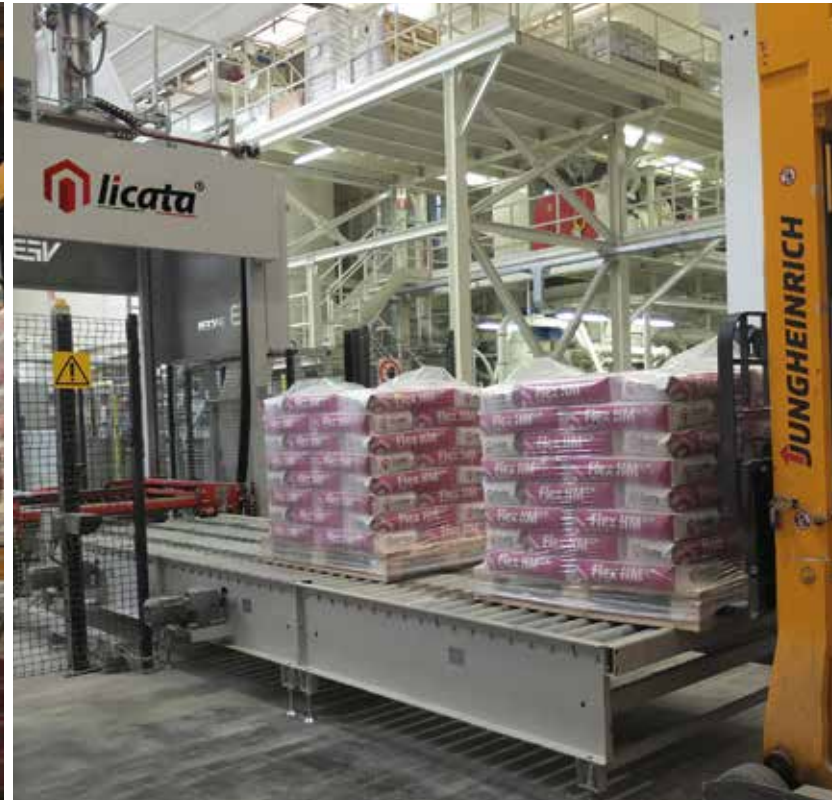
• Canicattì plant (AG)